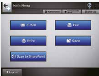
Main Menu screen

The N7100 satisfies the digitising needs in larger scale networks as well as in environments where more basic file servers and e-mail servers are deployed. It is right at home with more complex LDAP/LDAPS authentication-based networks, and allows for integration with Microsoft Exchange Servers, FTP servers, third party applications and portal and collaboration platforms.