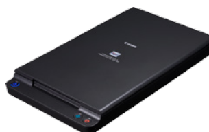
Flatbed Scanner Unit 102

Scan bound books, journals and fragile media by adding the Flatbed Scanner Unit 102 for documents up to A4 or Flatbed Scanner Unit 201 for A3 scanning. Connected by USB, these flatbed scanners work seamlessly with the DR-M260 in a smooth dual-scanning operation that lets you apply the same image enhancement features to any scan.