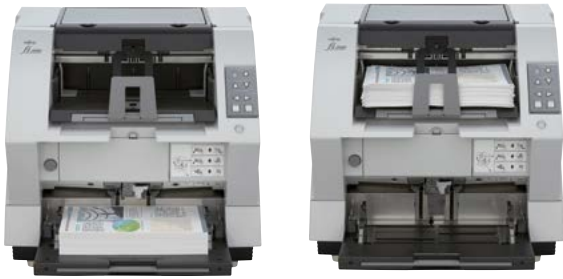
A4 Landscape at 300 dpi 135 ppm / 270 ipm A4 Portrait at 300 dpi 105 ppm / 210 ipm Scan mixed batches through the 500 sheet hopper