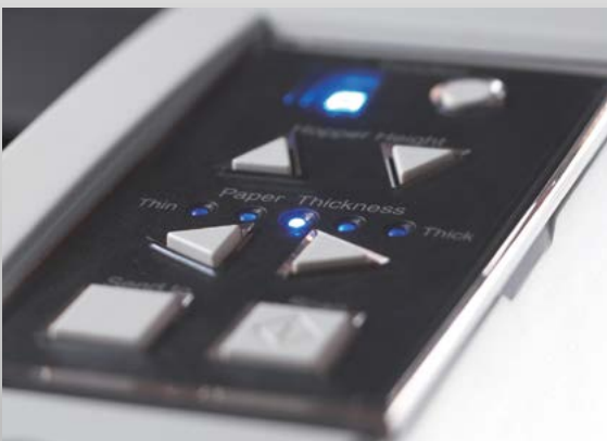
Integrated operating panel